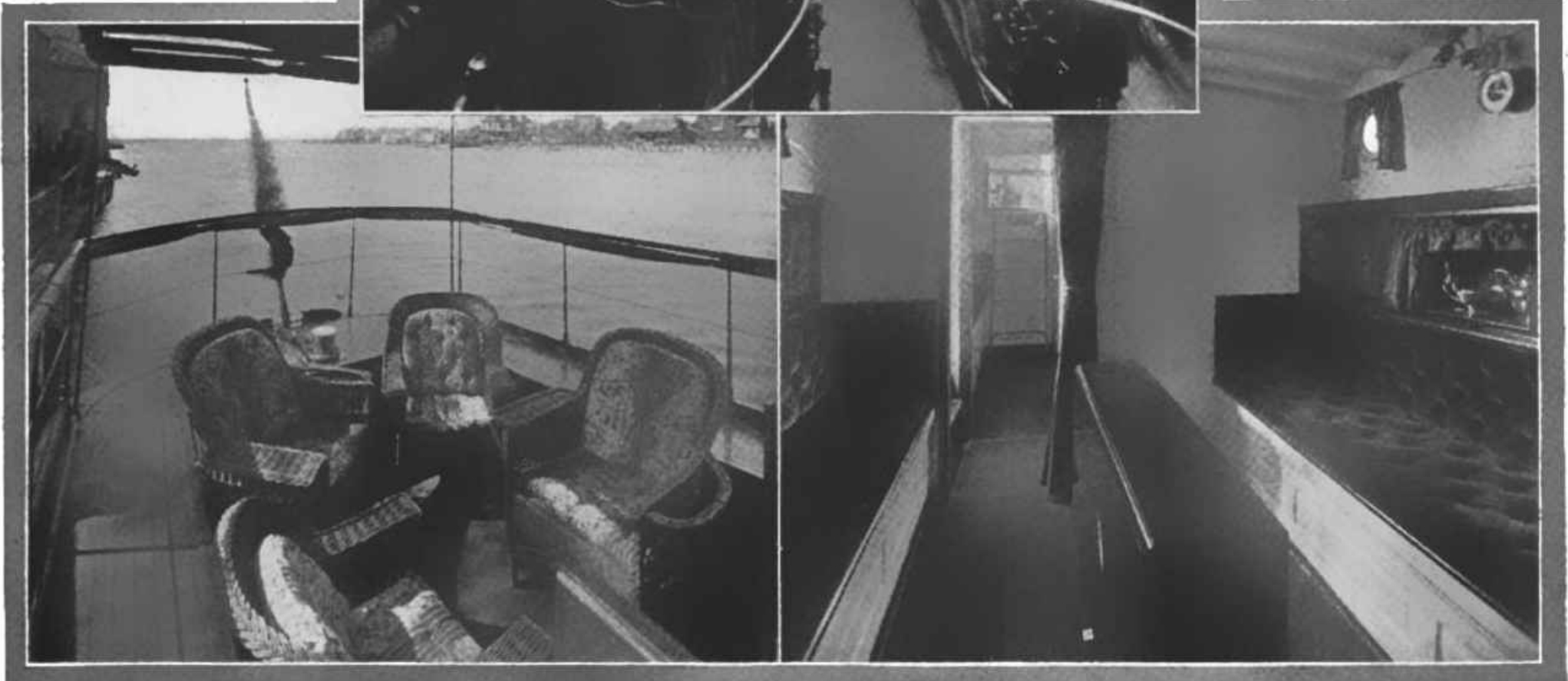
Views of the two Sterlings, the cabin and the after deck

The twin Sterling motors are of the high-speed type, developing a total of 400 h.p., and a resulting speed of 35½ m.p.h.