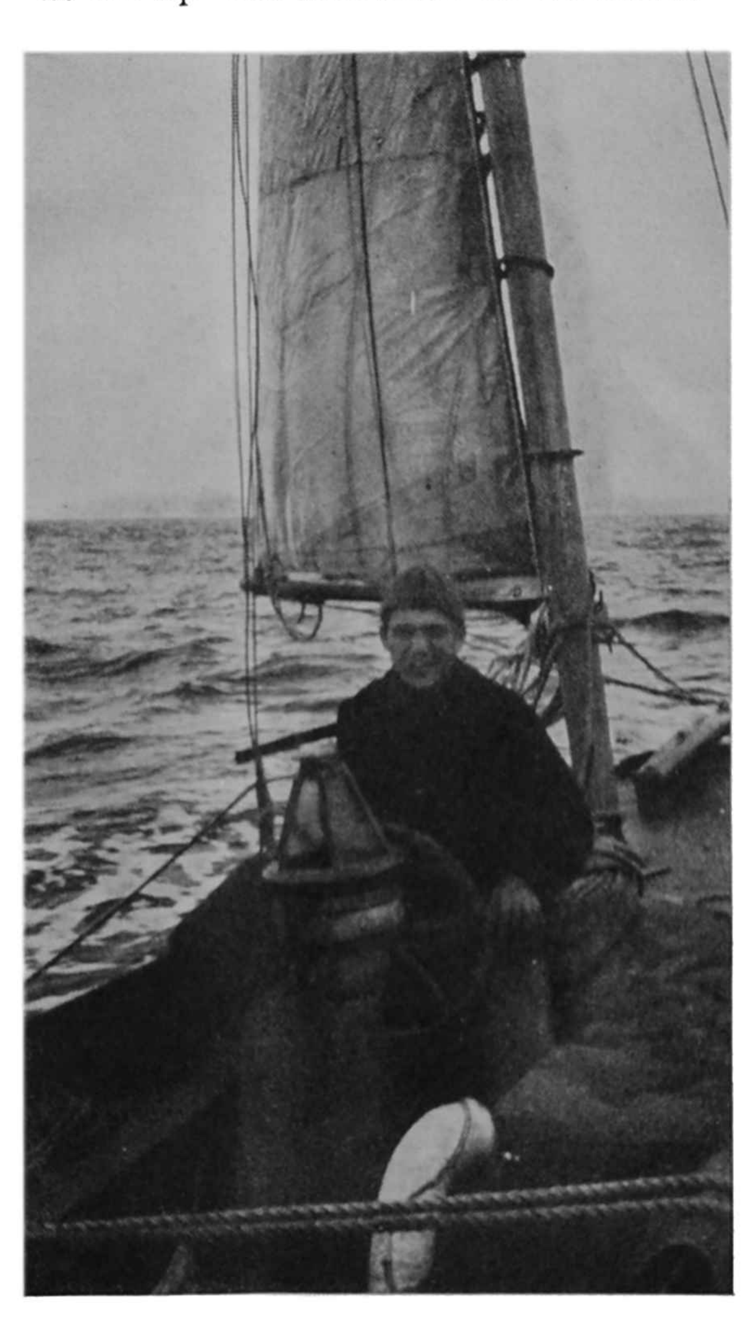
In mid-Atlantic with a fair breeze on July 26. One of the few days when fog did not shut out the horizon

It was this rapidly changing condition, plus the powerful gale which blew us on with a roar, which kept us on tip-toes and alive as we never